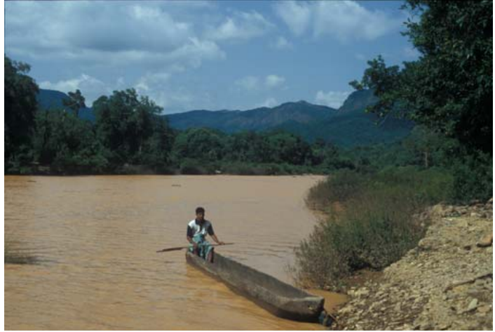
The Aganashini River

metamorphoses into a deep red, furious brute, with extremely fast, violent, and turbulent currents. Crossing the river in this state is quite difficult and very dangerous; 3 to 4 people from the region typically die each year in attempted river crossings. The nearest road via mountain and forest paths is over 15 km away from Bangane, and again an unfeasible option during heavy rains. Therefore for nearly 5 months every year the village is entirely inaccessible. This unique situation of Bangane, coupled with utter poverty and immobility, has kept it near complete isolation until the past decade.