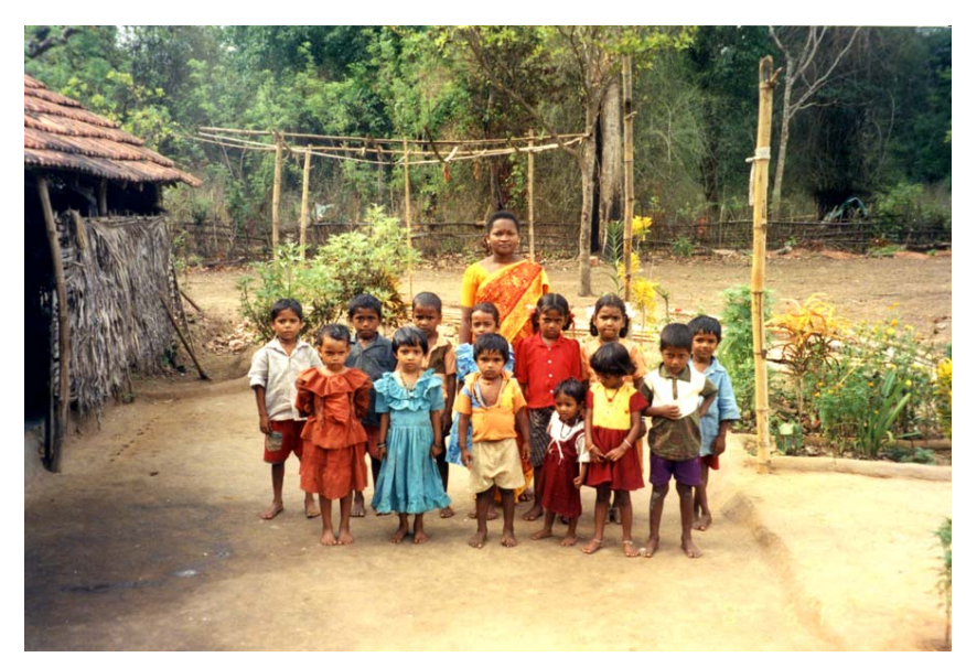
Balwadi children with teacher

These questions must be thought through quite carefully; in time I intend to consolidate these ideas and put together a manuscript regarding the ethical considerations of socioeconomic improvement, and the manner in which development should be approached. I hope that these products of the project in Bangane, on top of local benefits that the project provided, will have impact on upcoming issues in community development, and provided an exemplary framework for the course of future approaches to social work.