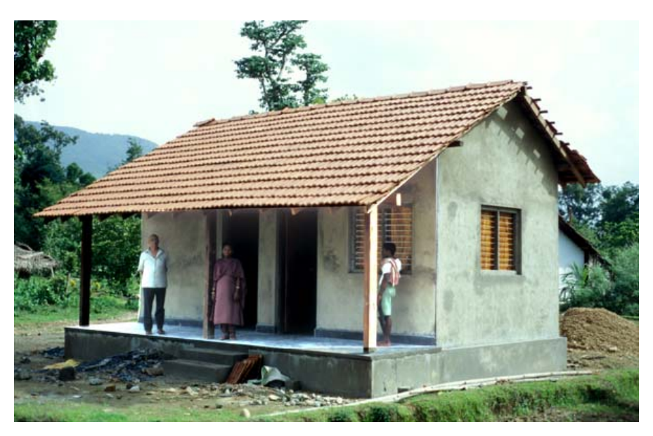
The newly constructed school building (front)

only local sewing machine (which is open for village usage). After its completion, the school building and land upon which it sits was signed over to the name of the Vanavasi Kalyan . The gratitude of the villagers is extremely difficult to express in words, but was manifested in a token of appreciation by the village. Towards the end of my stay in India, the villagers pooled what little materials and resources they had and hired a priest to hold a Satyanaryana Puja (a ceremony intended to bring well-being, satisfaction, and happiness to its beneficiaries). Each family gave everything they possibly could spare, a few tablespoons of milk, a coconut, a banana; it was here that both the poverty as well as true appreciation of the village became clear. This Puja (which is thought by the villagers to be very meaningful and powerful) was held specifically in honor of my grandfather, myself, and you- all those who contributed from a land so far away to make the construction of a school for the people of Bangane possible.