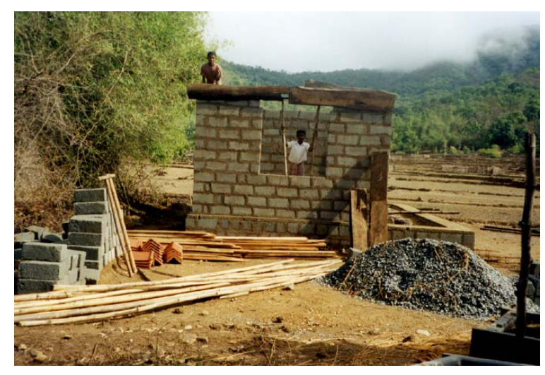
School construction with young helpers from village

The Vanavasi Kalyan Ashram is a non-profit tribal welfare institute promoting social, educational, and health well-being in poor villages across India. The dedication of the members of the organization is greater than that of any other that I have seen; its members are extremely honest and fully devoted to selfless service. None receive any compensation (the organization is completely voluntary) except a meager allotment for food ($10 dollars a month). Most interestingly, over 50% of the leaders